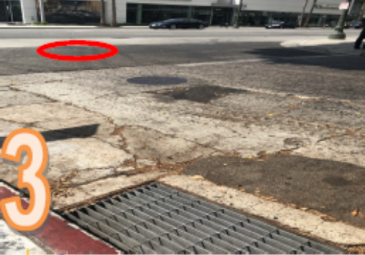
Citrus Ave & Wilshire Blvd